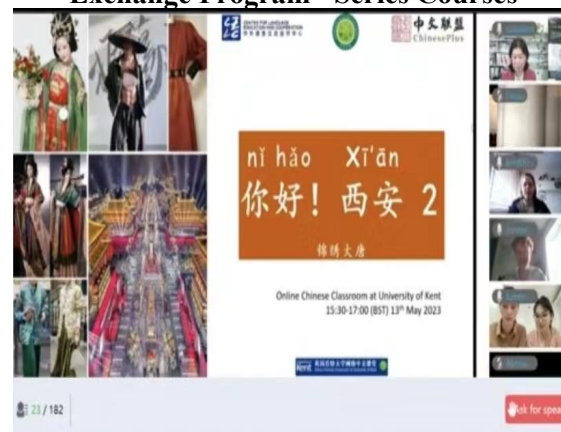
Figure 2. Global live Chinese Language Demonstration Class

At present, international students studying in Xi'an Kedagaoxin University are mainly language students and academic students. For