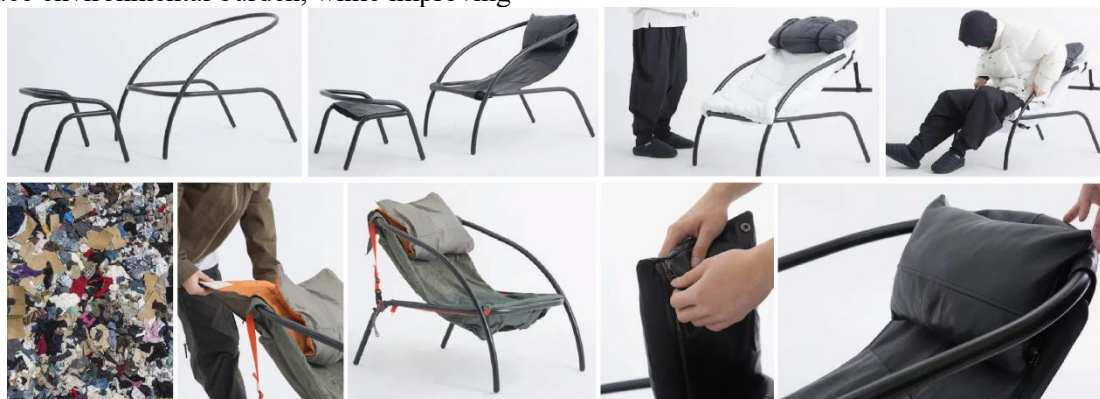
Figure 2. REBORN of the Chair

Green product design covers emotional functions, which can enable the product to meet the highest level of needs of users, establish positive emotional communication between the product and users, bring good experience to users, establish loyalty, and make the product stand out, greatly enhancing the core competitiveness of the product. Emotional design is a people-oriented design method. Through the design, the product can bring a positive and good experience to users, realize emotional communication and resonance with users, and enhance the value of the product. If we compare Maslow's hierarchy of needs and draw the product trait pyramid, we will find that products have different levels of characteristics — functionality, dependency, usability and pleasure, while emotional design is in the upper level of "pleasure".