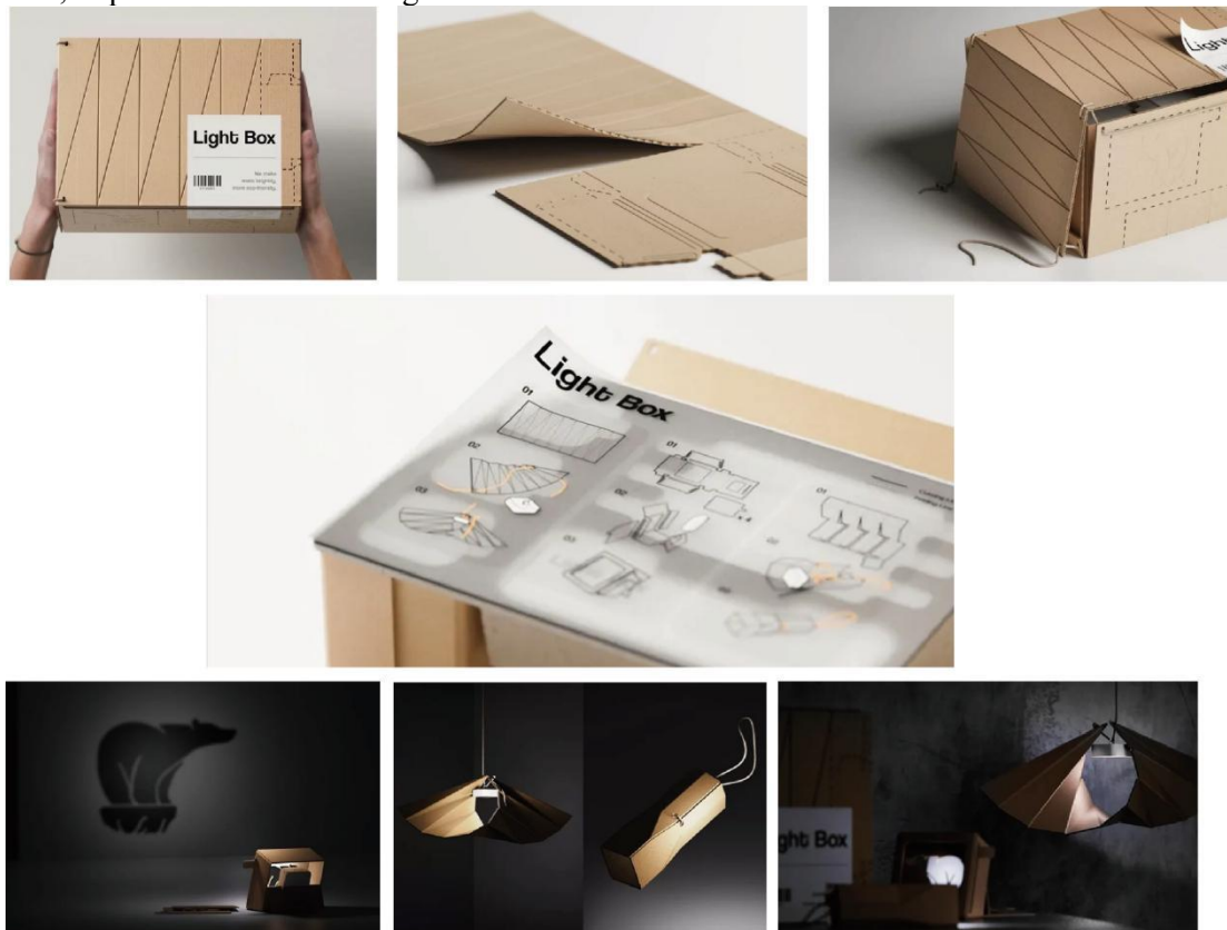
Figure 1. LightBox

own production, enhance the interactive experience between consumers and packaging, avoid the behavior of when the packaging is used up, and achieve the goal of green environmental protection.